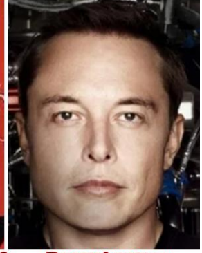
BOSSY LOOTER ELON MUSK

THE COMPLETE SEPARATED@BIRTH? COLLECTION THE DAWG KICKERS & PUNTERS COLLECTION THE ELON MUSK COLLECTION