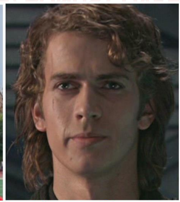
ESCAPADE SPINNER ANAKIN SKYWALKER