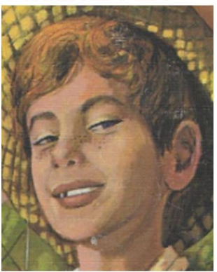
Tom's Bud Huckleberry Finn

THE COMPLETE SEPARATED@BIRTH? COLLECTION THE MISSISSIPPI COACHES COLLECTION THE LITERATURE COLLECTION